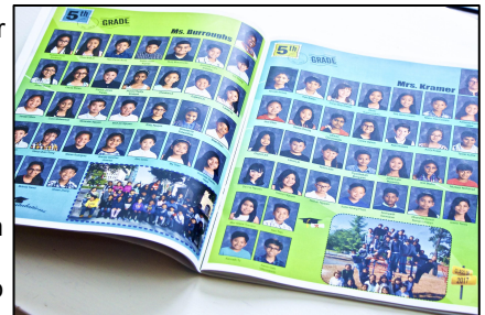
The Northwood Yearbook 2016/17

Monday, April 9th is the last day to enjoy the special discount of the Yearbook pre-orders. The price will go up to $22 after Monday, April 9th,